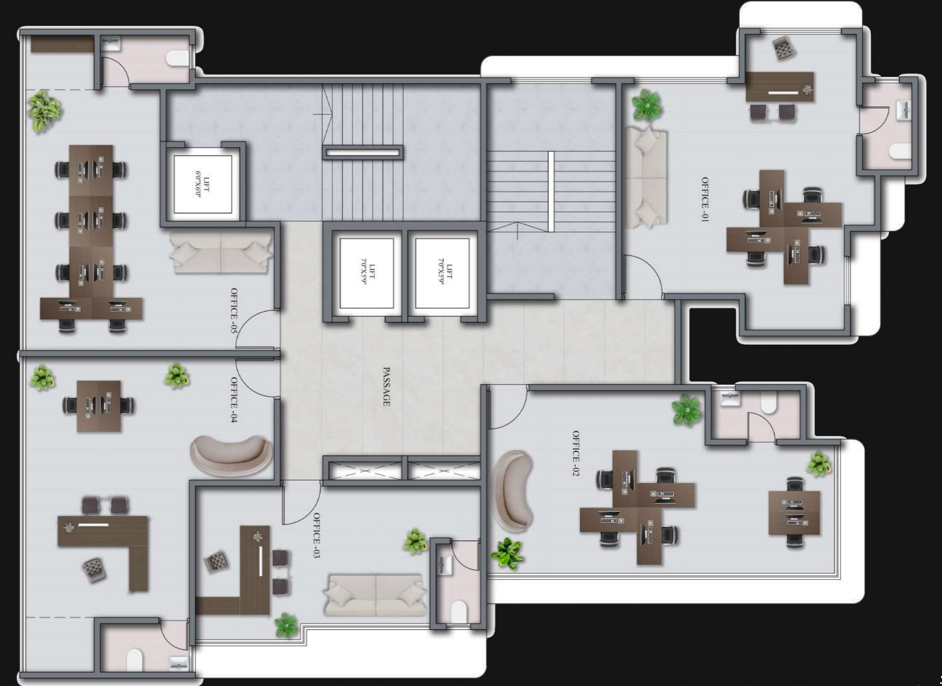
SECOND & THIRD FLOOR PLAN